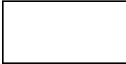
24" x 48"