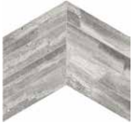
2 x 8.5 in / 5.3 x 21.3 cm Chevron Mosaic Honed 5001-0325-0