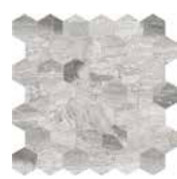
2 in / 4.9 cm Hexagon Mosaic Honed 5001-0324-0