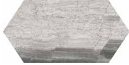
24 in / 60 cm Picket Honed 5000-0428-0