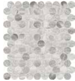
1.25 in / 3 cm Penny Round Mosaic Honed 5001-0327-0