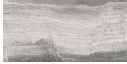
12 x 24 in / 30.5 x 61 cm Honed 5000-0425-0