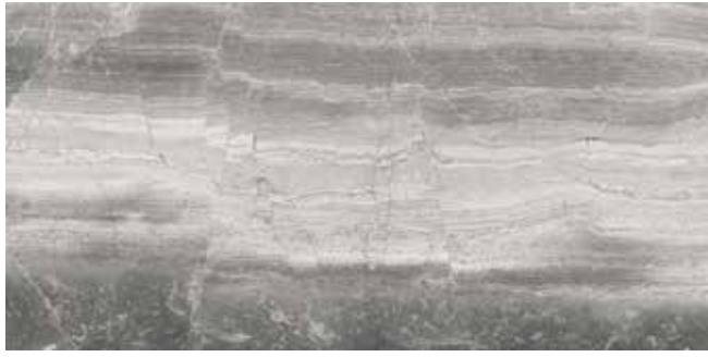
18 x 36 in / 45.7 x 91.4 cm Honed 5000-0424-0