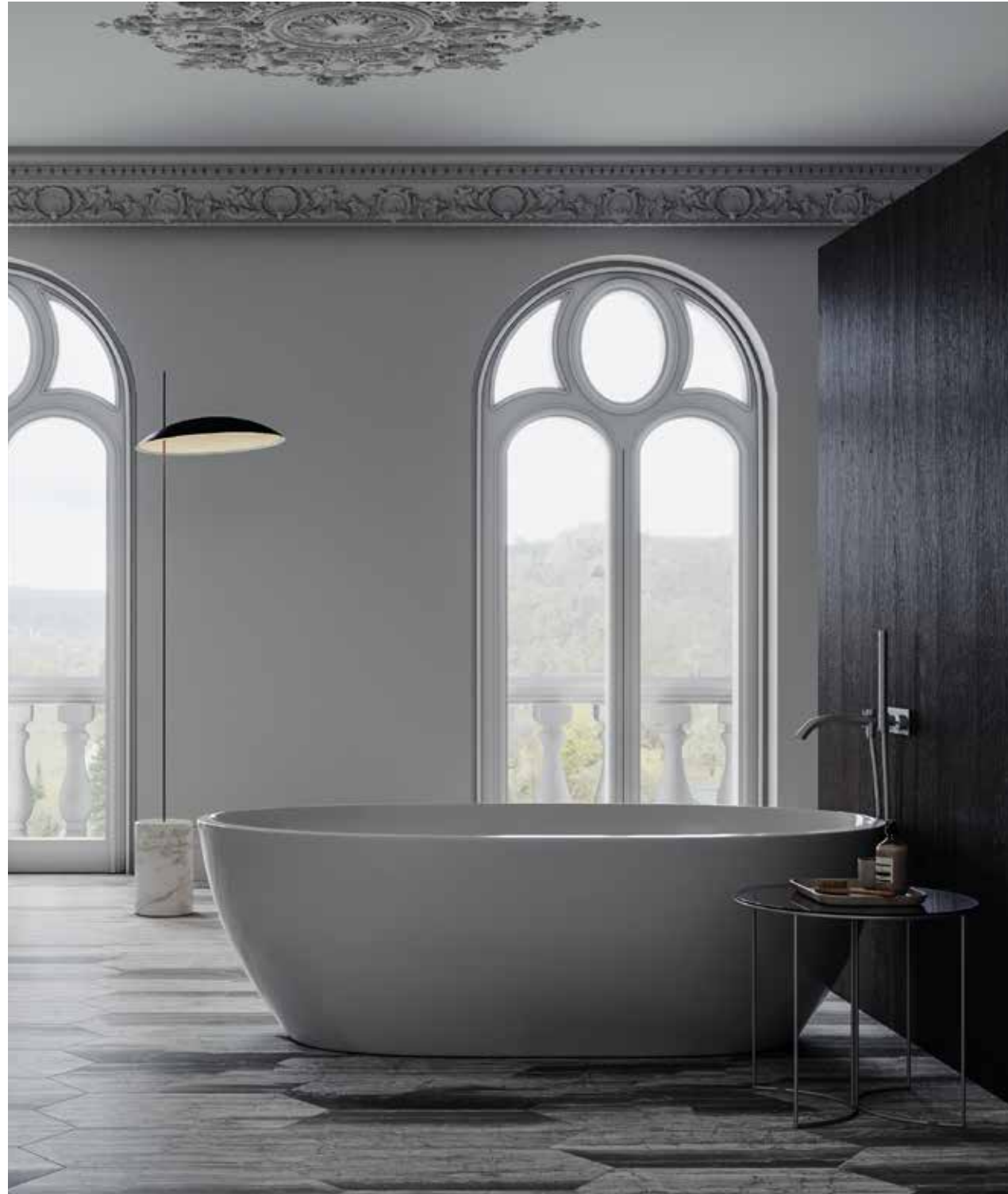
24 in / 60 cm Volcana Notte Picket Honed Marble Tile