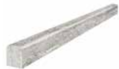
1/2 x 12 in / 1.3 x 30.5 cm Deco-Bar Honed 5002-0119-0