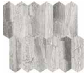
2 x 6 in / 4.9 x 15 cm Picket Mosaic Honed 5001-0326-0