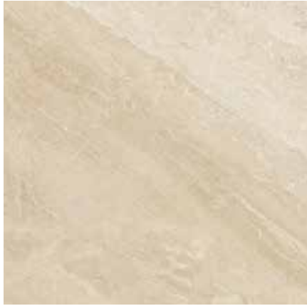
24 x 24 in / 61 x 61 cm Polished 5000-0081-1 Honed 5000-0082-1