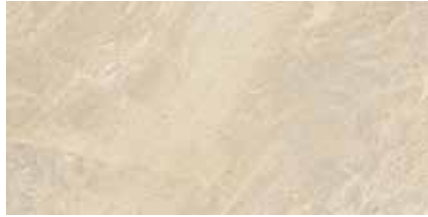
12 x 24 in / 30.5 x 61 cm Polished 5000-0077-1 Honed 5000-0076-1