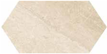
24 in / 60 cm Picket Honed 5000-0385-0