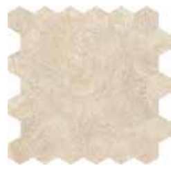
2 in / 4.9 cm Hexagon Mosaic Polished 5001-0292-0 Honed 5001-0291-0