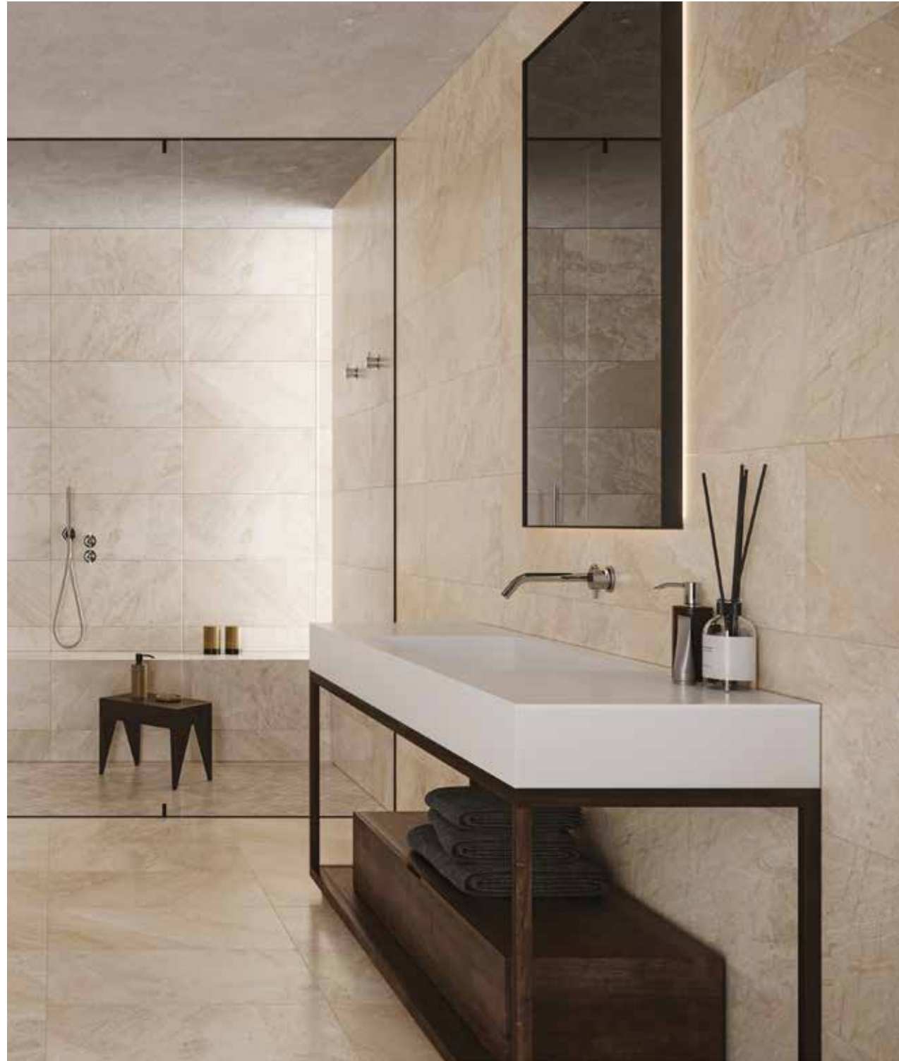
12 x 24 in / 30.5 x 61 cm Impero Reale Honed Marble Tile