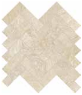
1.25 x 4 in / 3.3 x 10 cm Herringbone Mosaic Polished 5001-0294-0 Honed 5001-0293-0