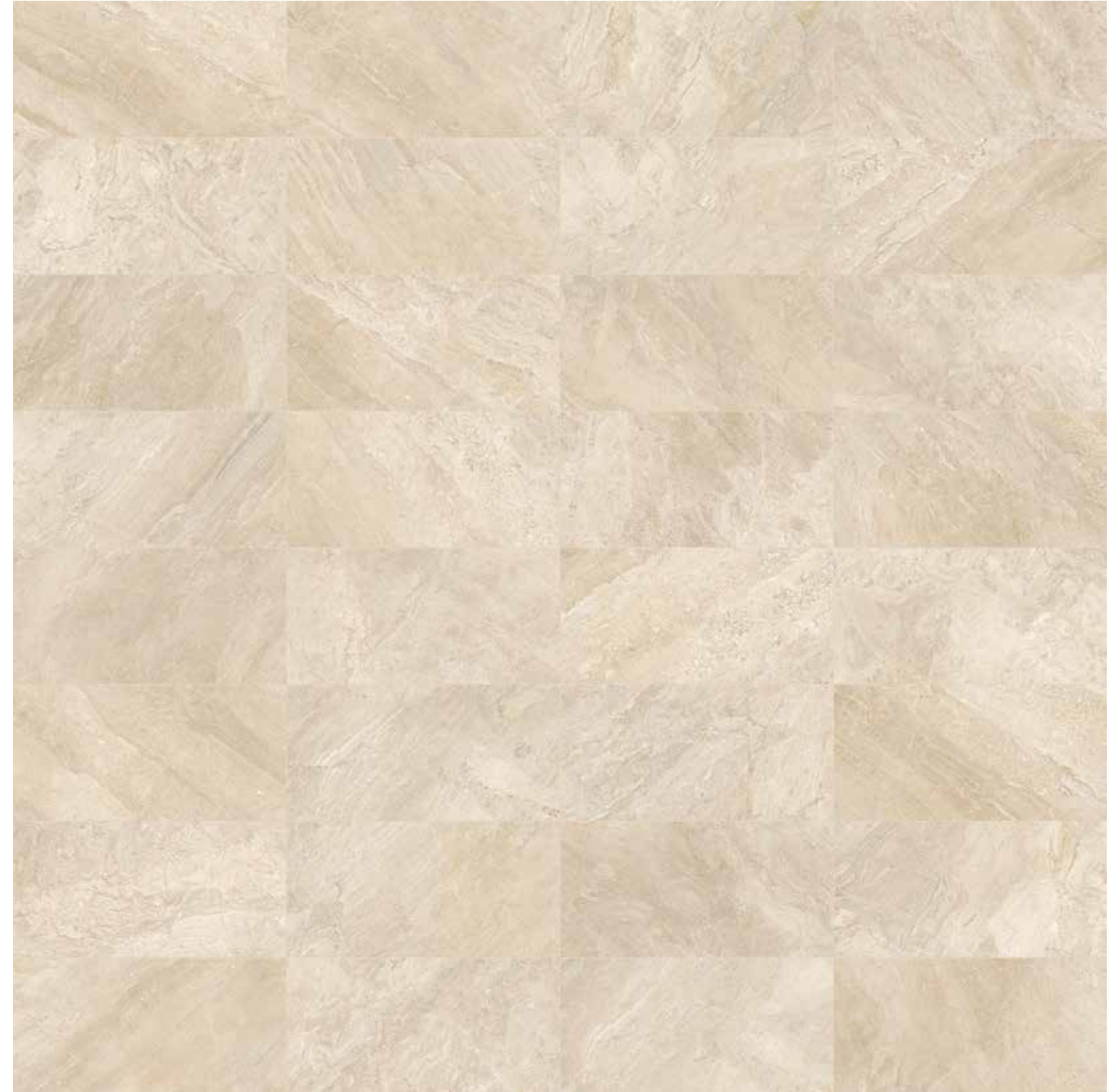
12 x 24 in / 30.5 x 61 cm image variations

The inherent beauty of natural stone products is expressed through variations in color, texture, shading and veining.