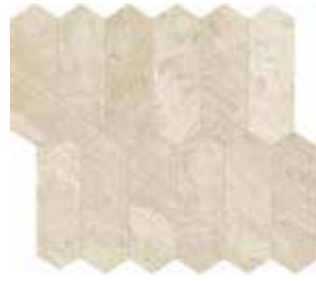
2 x 6 in / 4.9 x 15 cm Picket Mosaic Polished 5001-0296-0 Honed 5001-0295-0