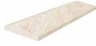
4 x 12 in / 10 x 30.5 cm Prisma Honed 5000-0630-0