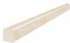
1/2 x 12 in / 1.3 x 30.5 cm Deco-Bar Polished 5002-0102-0 Honed 5002-0101-0