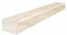
1.25 x 12 in / 3.2 x 30.5 cm Deco-Bar Honed 5002-0103-0