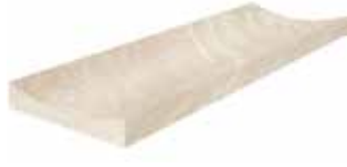
4 x 12 in / 10 x 30.5 cm Fluto Honed 5000-0629-0