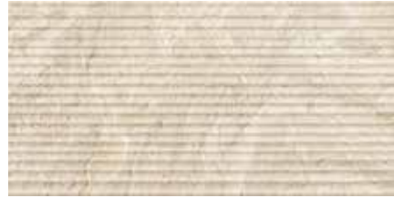
12 x 24 in / 30.5 x 61 cm Curva Honed 5000-0628-0