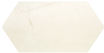
24 in / 60 cm Picket Honed 5000-0375-0