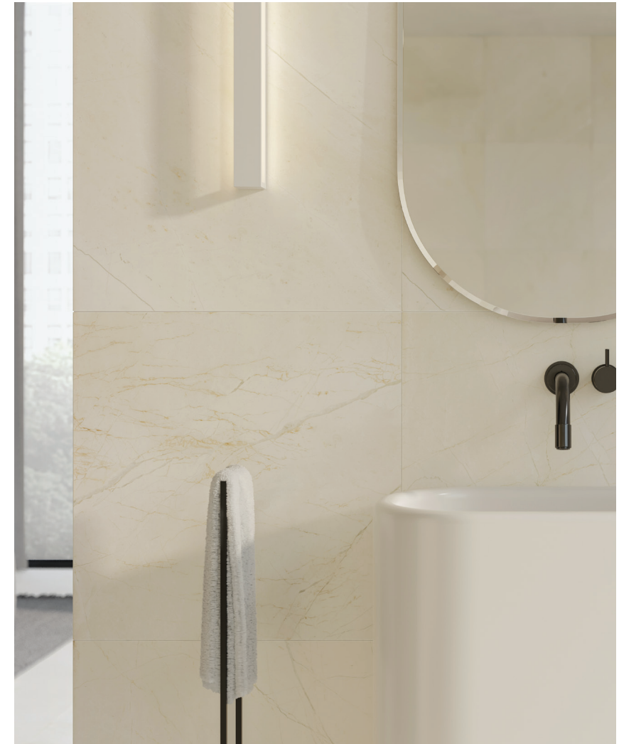
24 x 24 in / 61 x 61 cm Avorio Crema Honed Marble Tile