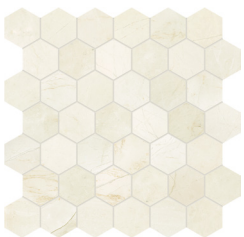
2 in / 4.9 cm Hexagon Mosaic Honed 5001-0257-0