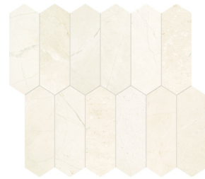
2 x 6 in / 4.9 x 15 cm Picket Mosaic Honed 5001-0259-0