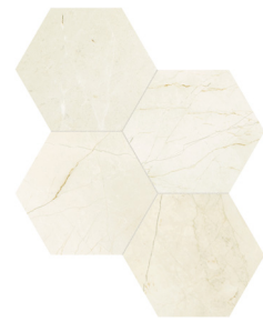
6 in / 15 cm Hexagon Mosaic Honed 5001-0260-0