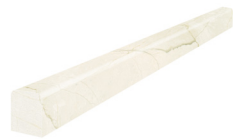
1/2 x 12 in / 1.3 x 30.5 cm Deco-Bar Honed 5002-0132-0