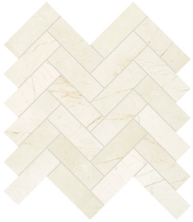
1.25 x 4 in / 3.3 x 10 cm Herringbone Mosaic Honed 5001-0258-0