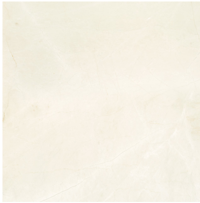
24 x 24 in / 61 x 61 cm Honed 5000-0371-0