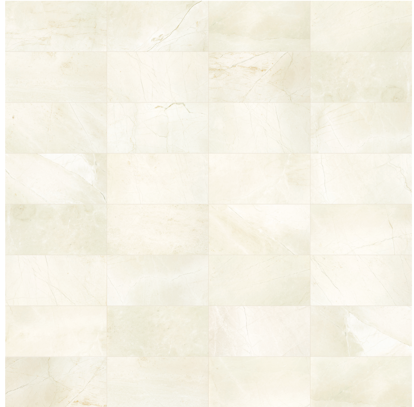
12 x 24 in / 30.5 x 61 cm tile variations

The inherent beauty of natural stone products is expressed through variations in color, texture, shading and veining.