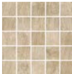
29927/M12 Sierra Clay 25pc