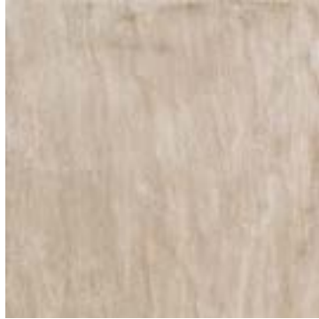
29936 Coastal Sand