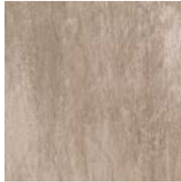
29927 Sierra Clay