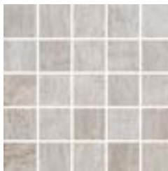
29914/M12 Delta Haze 25pc