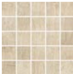
29936/M12 Coastal Sand 25pc