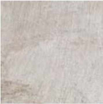
29914 Delta Haze